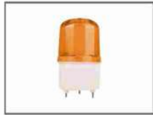
AZ AF LAC 19A Alarm Flash Lamp