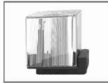
AZ FL 19 Flash Lamp